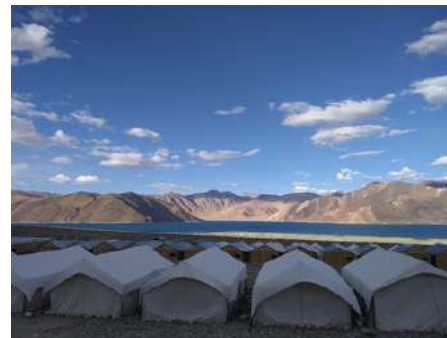
100 sky Camp