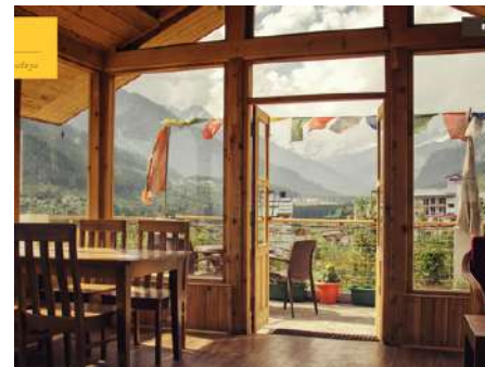
Keylinga inn Manali