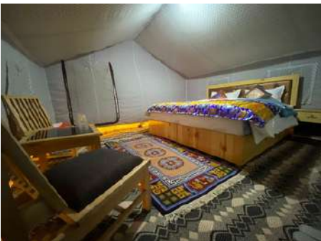
Frozen Pangong Camp