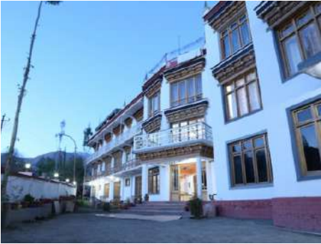
Hotel Horpo Leh