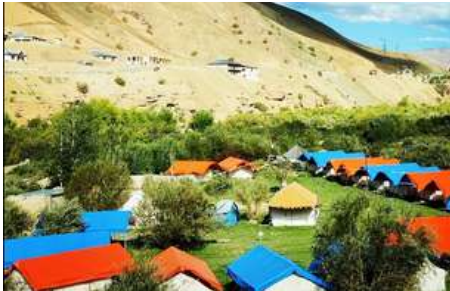
Nun Kun Camp