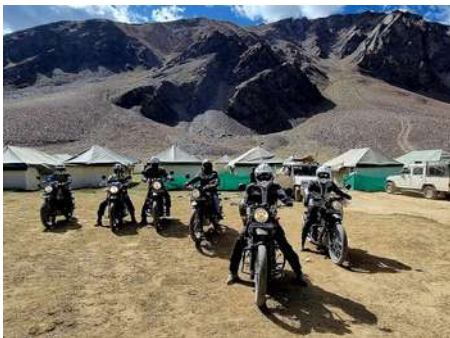
Himalayan Spirit or Golddrop